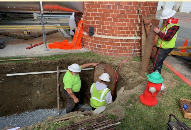
VA Medical Center, WRJ, VT